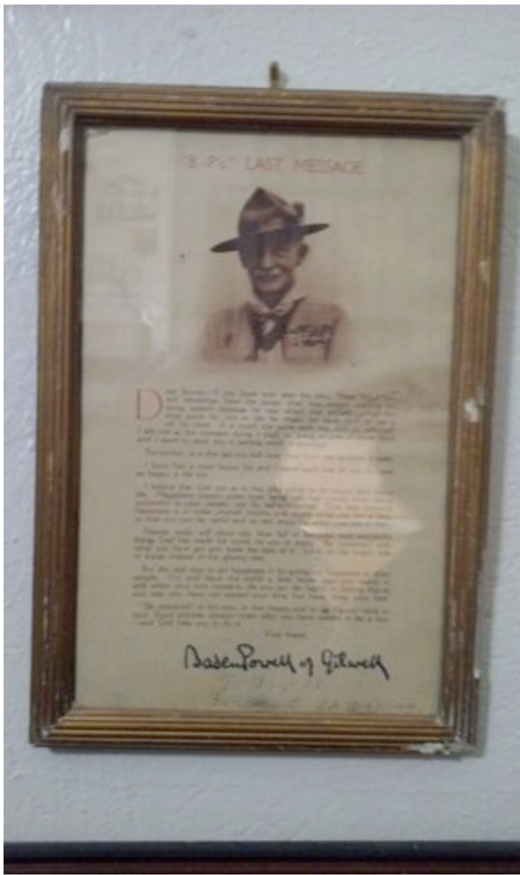
Baden Powell's Final Message Enlarged below: please READ!!!!