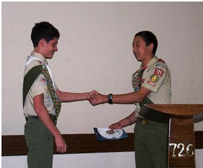
Photo from Spring Court of Honor