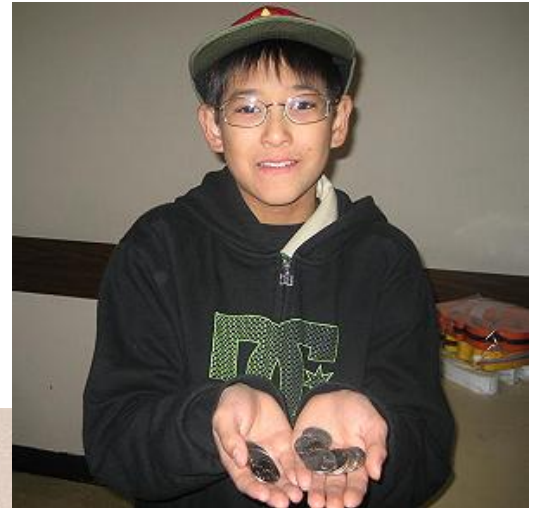
Michael's coin collection