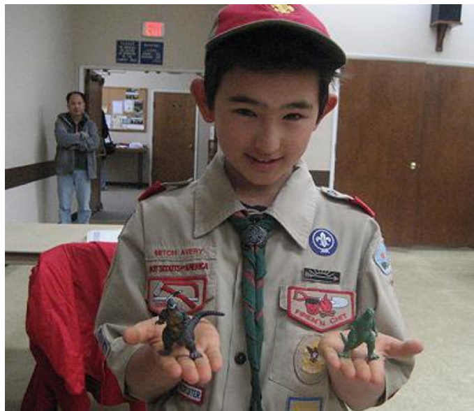
Mitch's Gazella Figurine Collection

"Hobby Night" showcased our Scouts diverse interests and many talents. See the photos below for some of the things they brought!