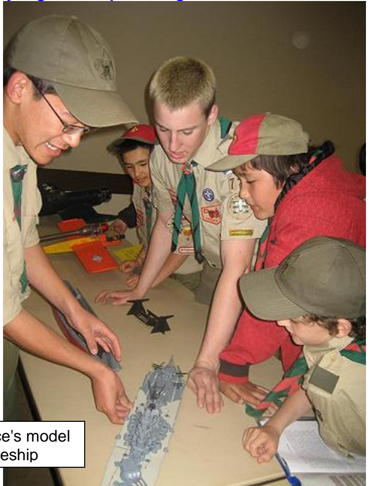
Bryce's model battleship