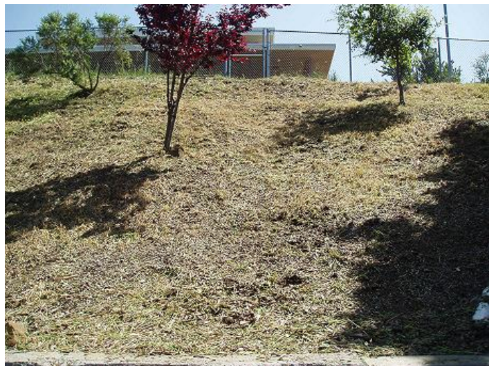
AFTER! A Job Well Done!!