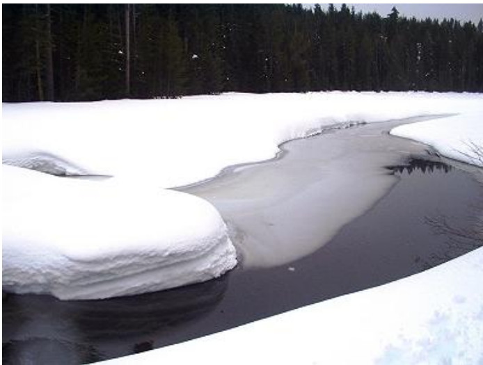
Klondike 2010