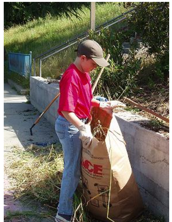
T726 working on clearing a hillside at Independent Elementary, Castro Valley