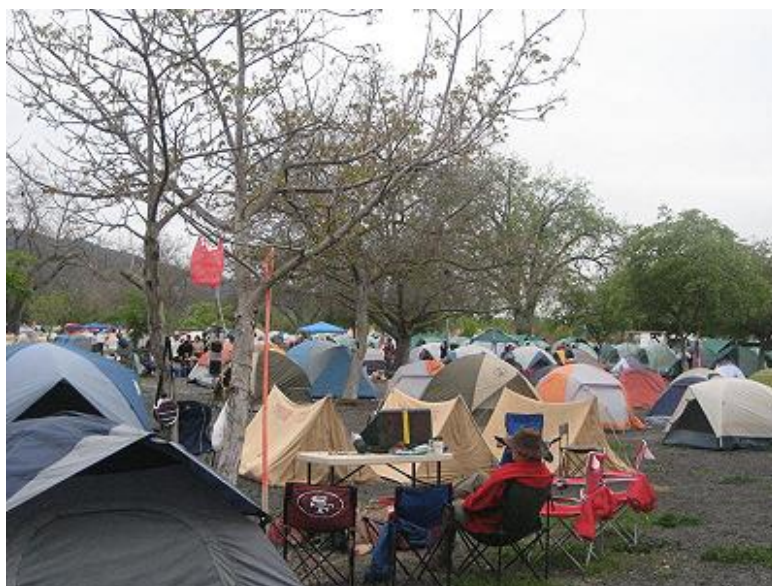
View of 726 camp site with surrounding 8,500 campers.