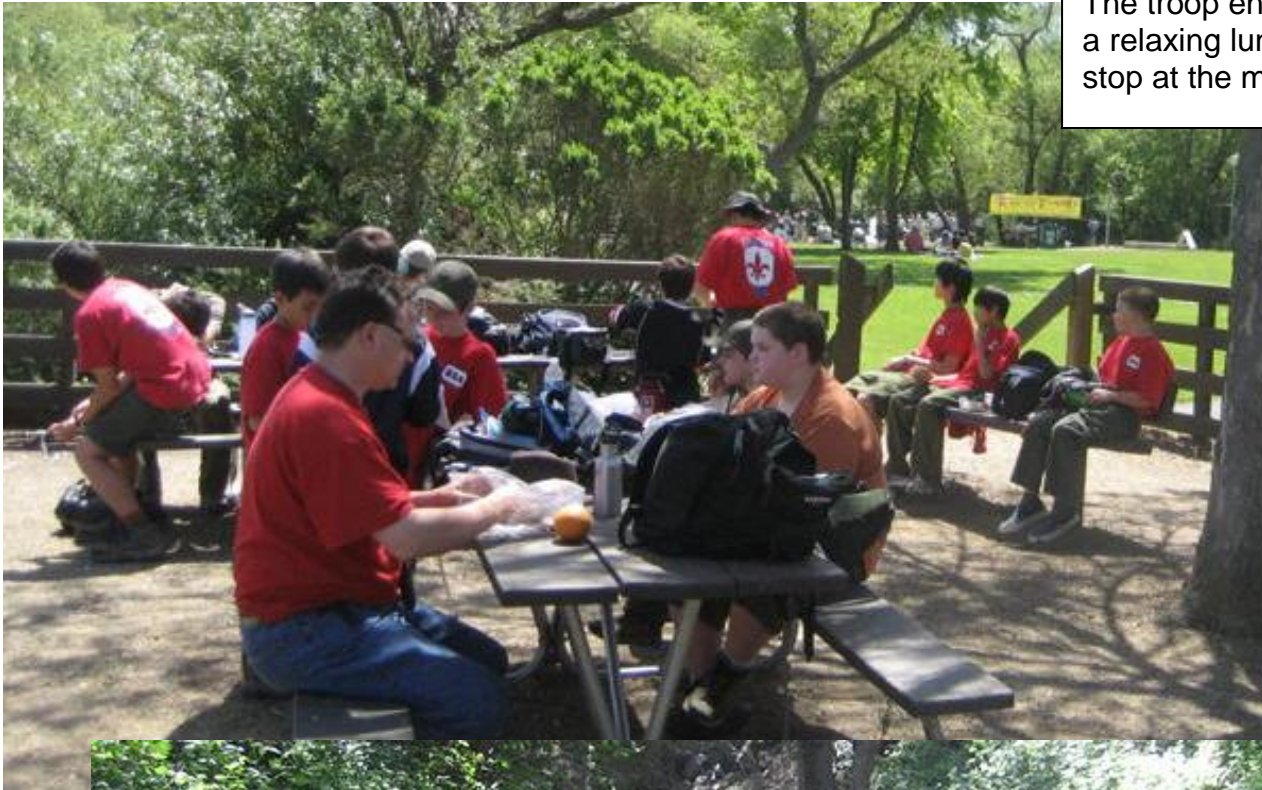
The troop enjoying a relaxing lunch stop at the marina