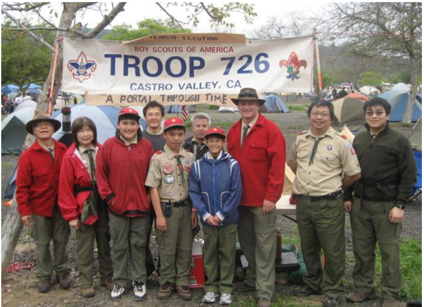
Group photo at campsite "gateway"

At the end of the day, we went to the arena for the end ceremony, where we listened to lots of music, such as rap, rock, band, and choir. We watched amazing acts performed by acrobats, the Alameda County Police, and the Boys club choir. Though it was more than two hours long, it was very entertaining.