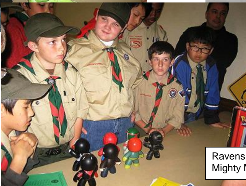
Ravens staring down Mighty Muggs